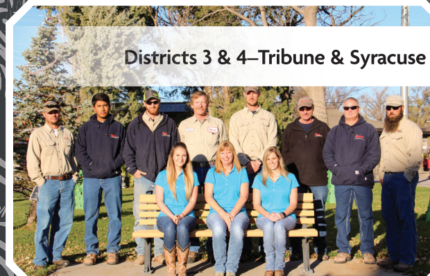
Districts 3 & 4—Tribune & Syracuse