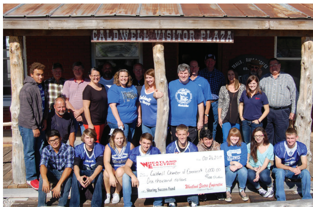
Volunteers who assisted with the Visitor Center project and representatives of the Caldwell Chamber of Commerce are presented with a $1,000 check from Wheatland's Sharing Success fund.

The visitor's center will highlight annual festivals and events and provide contact information for the city offices, schools, parks, the Sumner County Hospital and other amenities. Visitors can also find instructions for the new Historical Virtual Tour guide app, produced and installed by KanOkla Networks, which provides a self-