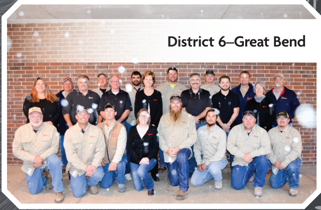
District 6—Great Bend