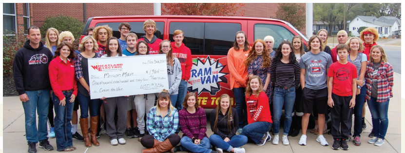
Conway Springs High School students helped to raise $1,964 and 2,700 pounds of donations for the Mission Mart food bank during the week-long Cardinals Care food drive.