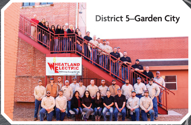
District 5—Garden City