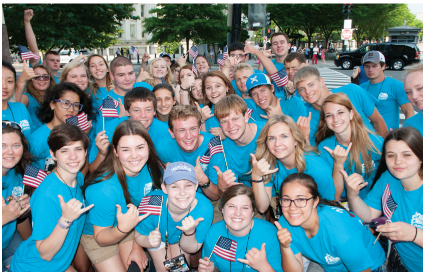
The 36 Kansas-Hawaii delegation toured the White House during the 2017 Electric Cooperative Youth Tour.

Two winners will also be chosen to attend Cooperative Youth Leadership