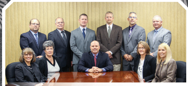
Executive Team—Scott City