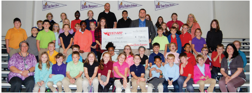
Students from Central Kansas Christian Academy are presented with a check for $500 for winning the Cram the Van School Challenge in Great Bend.

You know Dasher and Dancer and Prancer and Vixen, Comet and Cupid and Donner and Blitzen. And of course, you know that famous fellow with the red nose. Nine of them in all, tasked each year with pulling Santa's sleigh. But how about another 41 of their closest friends? We're going to need to find them, all 50 of them.