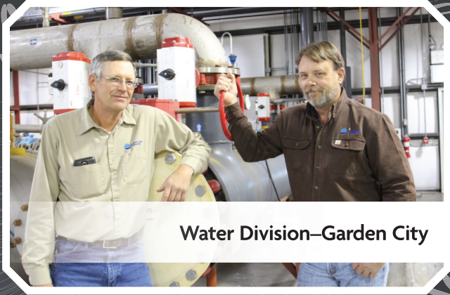
Water Division—Garden City