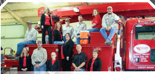
District 1—Scott City