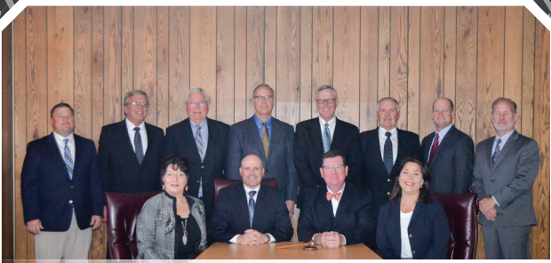
General Manager & Trustees