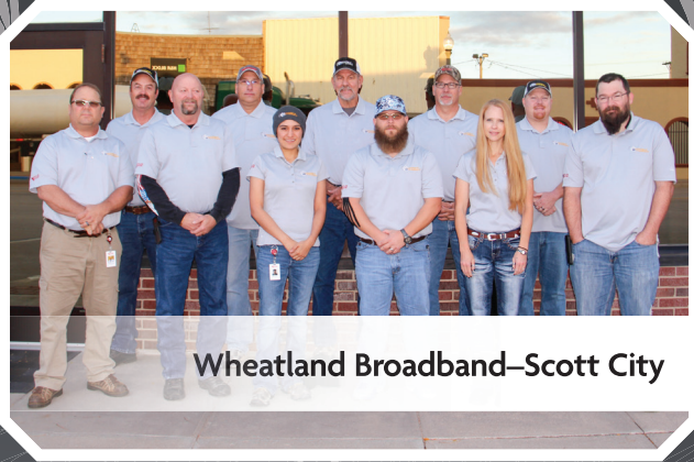
Wheatland Broadband—Scott City